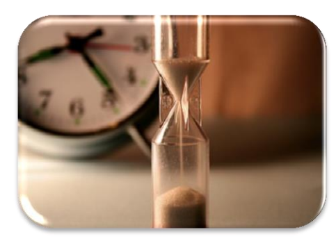
Fixed for 12 months