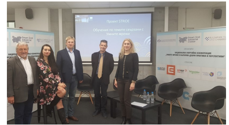
First National Energy Conference "Smart Grids in Bulgaria - Good practices and perspectives" in November 2021

On the 18th of November, the Bulgarian Energy and Mining Forum (BEMF) organised the first National Energy Conference on topic "Smart Grids in Bulgaria - Good practices and perspectives" at the Sofia Tech Park, both in person and online. The event was devoted to informing local policymakers about the STRIDE project. The STRIDE project objectives and activities were presented, as well as the project training materials. The municipality representatives were acquainted with basic notions, definitions and perspectives of Smart Grids (SGs). The event combined training of local policy makers for their preparation to include SG concepts in policy documents and the sharing of good practices and SG perspectives by the leading players in the energy sector in the country.