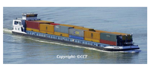
Specifics: HVO as fuel

Location: Alpherium-Rotterdam/Antwerp Organisers: HEINEKEN In operation: since 2019