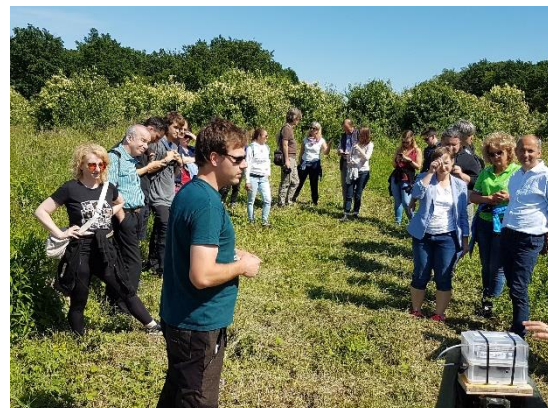
Image 9: Field visit to Pöttsching green bridge