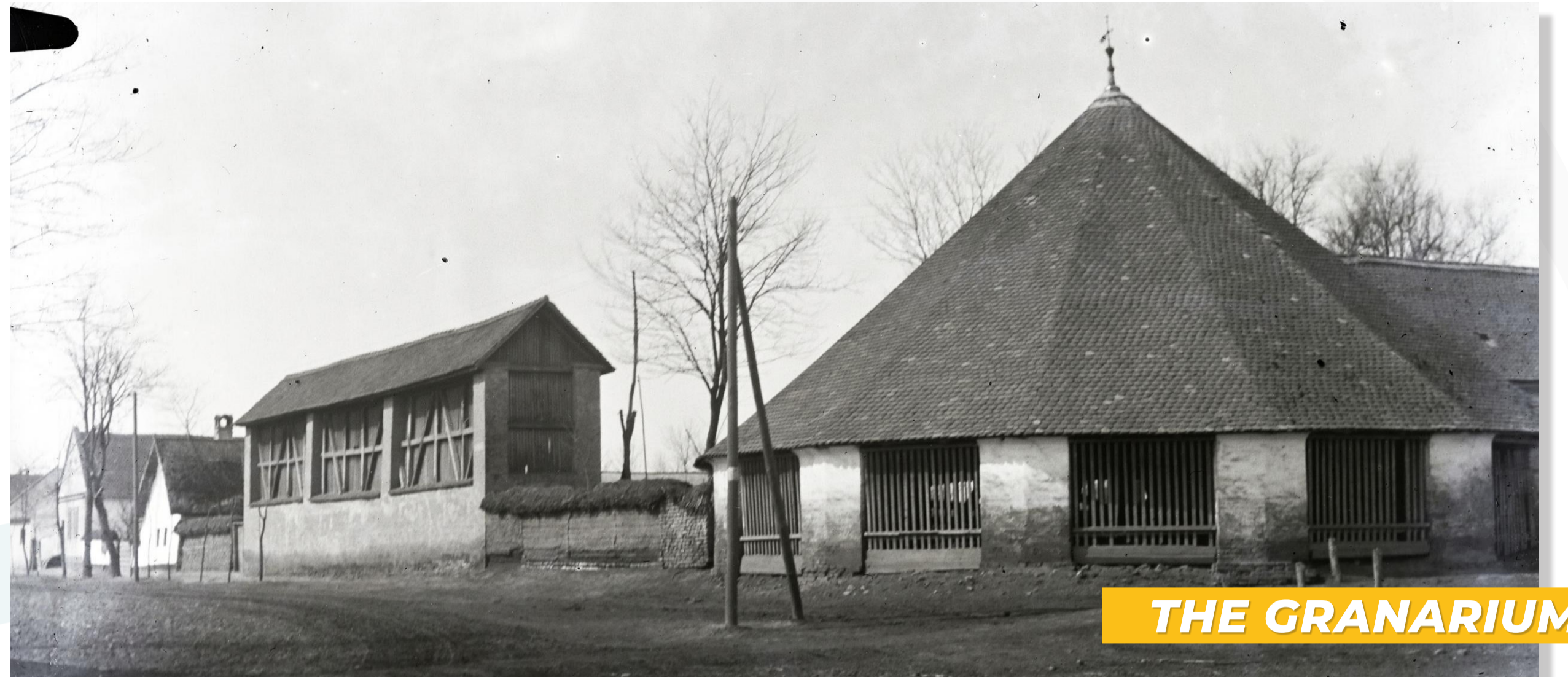
"Mill in 1924"

Based on the features of the district's functions and the live music club already operating next door, the designated development direction is aimed at young people.