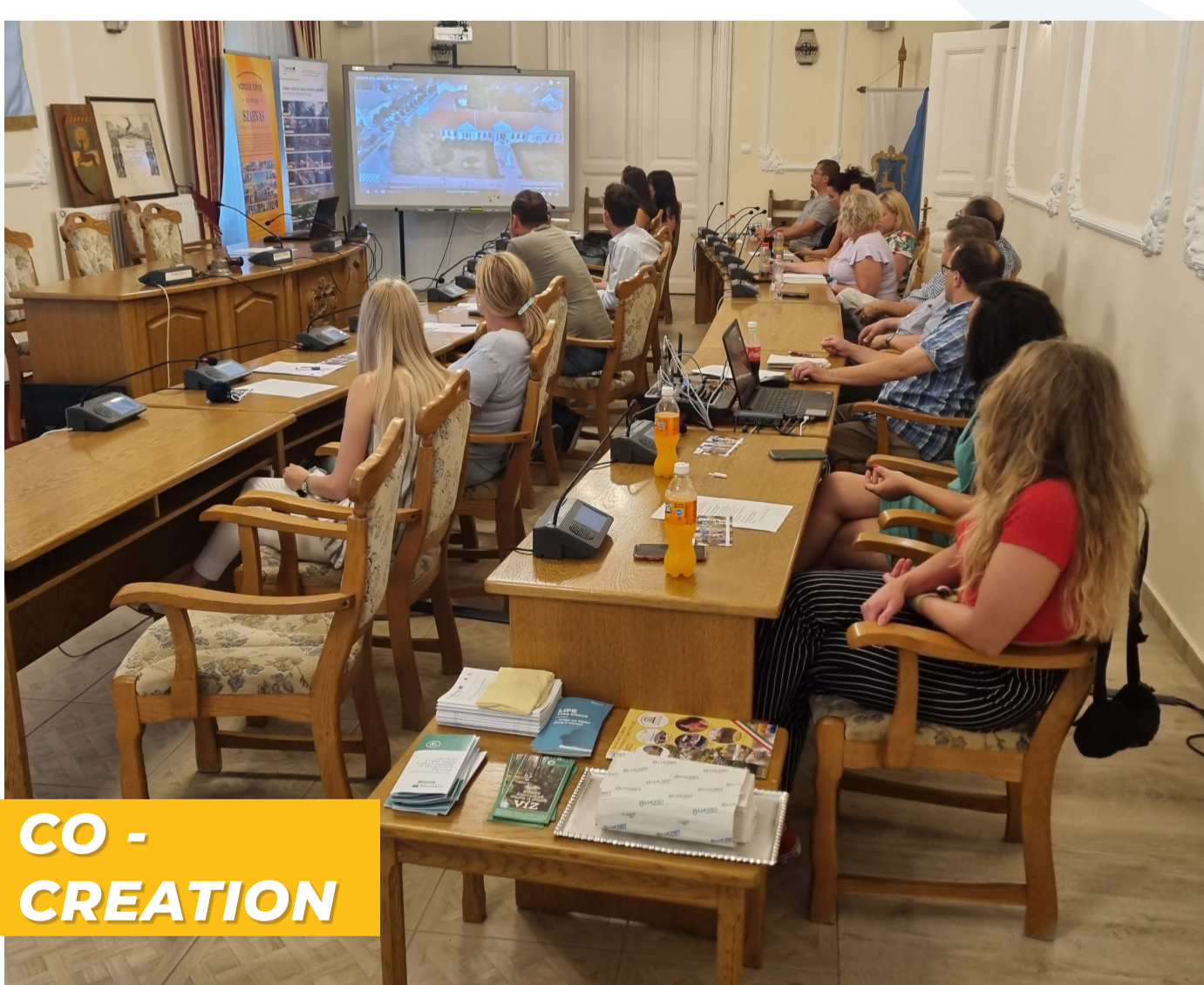
"Co-creation workshops at the Cityhall"