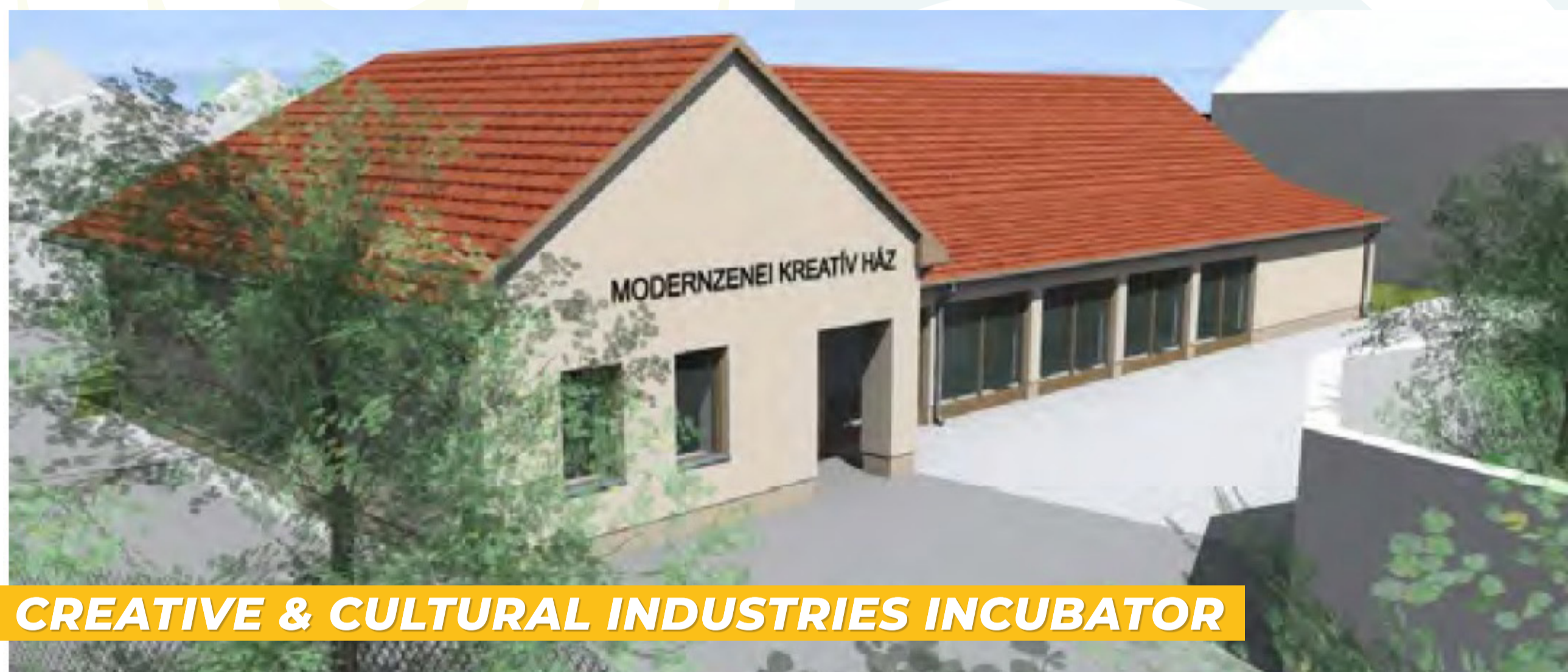
"Design plan of the CCI Incubator"(c) KOMPAKT Design Mérnökiroda Ltd.

scan the QR CODE >> and join the AGORA local team in a City Walk discovering more AGORA Areas