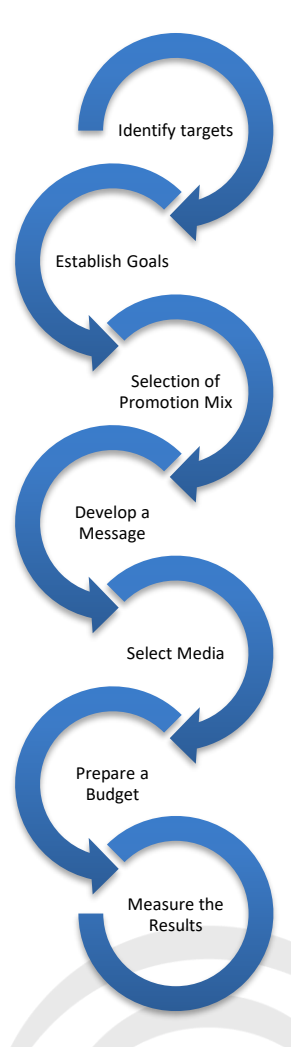
Figure 1: Communication Campaign Process

The following graph provides on overview on the different stages of a successful promotion campaign: