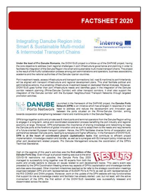
Figure 4: Capitalisation Factsheet

• Newsletter which will be elaborated at the end of each period provide a comprehensive overview on the impact of the project's proceedings for the well-being of Danube IWT. Until now, 2 editions of the newsletter were elaborated and successfully disseminated.