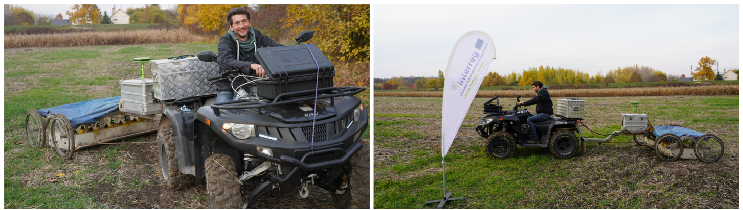
Archaeological geophysical prospection for the Living Danube Limes project

These highly sensitive instruments can detect buried structures when their physical properties contrast measurably with their surroundings, such as stone walls and settings, pits, postholes and fireplaces. For the project surveys, the team applied motorised multi-sensor measurement systems; they can cover large areas in a short time and therefore have great potential for the efficient exploration of archaeological landscapes.