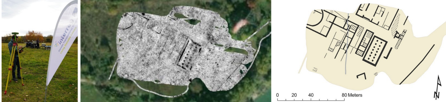
Photo left: Setting up the GPR system at Százhalombatta; Photo middle: Survey field in the area of the Roman fortress; Photo right: Interpretation of the GPR data showing Roman building structures.

At the Hungarian pilot site Százhalombatta-Dunafüred (Matrica) the fieldwork team conducted a GPR survey at the former Roman camp, the bath and vicus. In the area of the vicus several Roman houses – some with stone floor pavements - and adjoining agricultural fields could be observed in the GPR data images. Within the Roman fortress excellent GPR results revealed massive Roman walls, pillars, and buildings which can be assigned to the phase of the camp. The structures show typical ground plans comparable to known Roman building elements such as courtyards, barracks, and granaries.