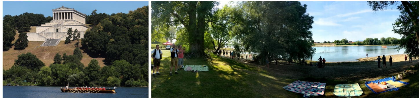
Photo left by Mathias Orgeldinger; Photo right: Stephansposching (Photo by FAU)

Here, however, special circumstances were waiting for us. There was no suitable landing stage, but there was a ferry service between Stephansposching and the opposite Mariaposching. The plan was for the Danuvina Alacris to dock at the side of the ferry. This worked out wonderfully and there was great relief in view of the day's work. However, a little excitement was still ahead. A water rescue boat was driven into the bay next to the boat. A manoeuvre went a bit wrong and this motor boat came into contact with four of our oars, which were still on display. Fortunately, nothing happened to the water rescue boat, but our oars were broken and had to be replaced. Late in the evening, the boat had to be detached from the ferry and brought to the other shore in Mariaposching, where it could spend the night.