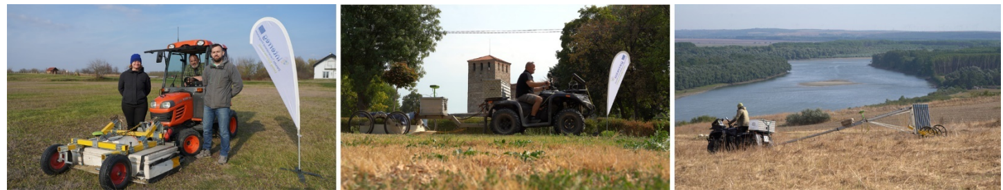
Photo left: The Croatian project partners of IAHR joining the GPR survey in Kopačevo; Photo middle: GPR survey at Baba Vida in Vidin; Photo right: Beautiful yet challenging survey terrain at the Roman fortress Sacidava.

Within the Roman fortress, many detected structures indicated former Roman buildings, the course of former walls and the debris of brick walls and brick roof tiles. Within the early medieval settlement and the Getic fortress, many larger pits might indicate settlement structures, in some cases even pit houses. Interestingly, the test survey on a small area south of the Roman fortress, revealed several rectangular buildings as well as many smaller pits that could be interpreted as graves. Their origin – Roman or from a later period – could not be determined with certainty, however, the promising results encouraged the team to come back for further investigations in the future.