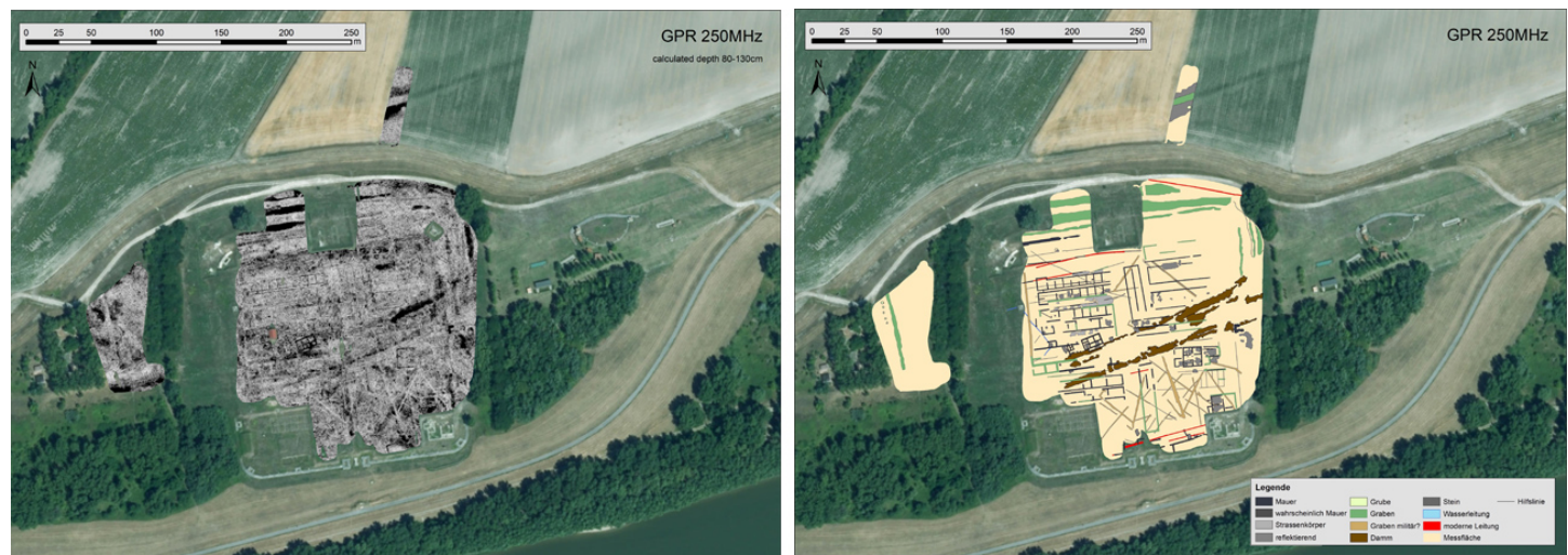
Photo left: Overview of the GPR survey with 250 MHz antennas; Photo right: Archaeological interpretative mapping of the GPR surveys of the Roman fortress at Iža.