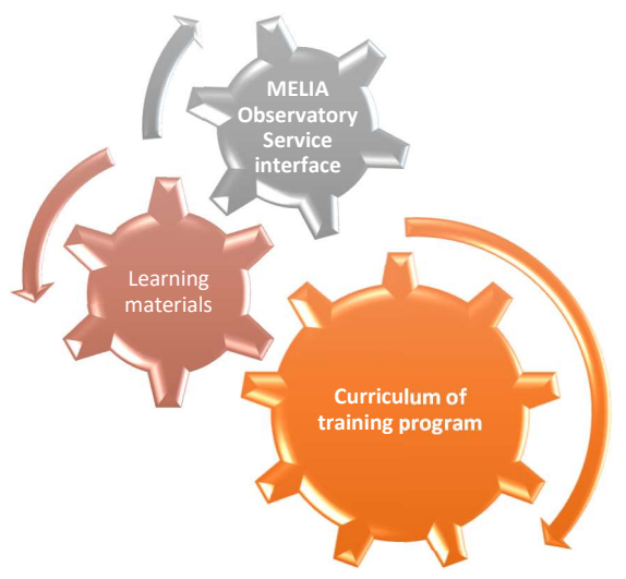
Figure 2: MELIA Observatory interconnected materials for educators

Within the MELIA Observatory, a series of materials as capacity-building tools on media for youth and youth educators were prepared. In parallel to those materials, we developed a multi-purpose interface that provides conditions for learning activities, aiming to support media literacy competencies among youth in the Danube region, boosting in the process civil participation. All below-listed materials will be available to the HEI in NGO stakeholders to be used by the end of the project.