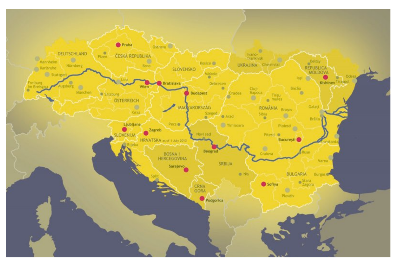
Danube Area. The catchment area of the Danube has a population of roughly 120 million and covers approximately 800.000 km², extending over 14 states, among them nine EU-member states (Germany, Austria, Czech Republic, Slovakia, Hungary, Slovenia, Croatia, Bulgaria and Romania) and five countries which are not EU-members (Serbia, Montenegro, Bosnia and Herzegovina, Ukraine, and Moldova)

FORESDA project gathered almost all of the Danube region countries (all but Czech Republic, Slovakia, Ukraine, and Moldova), and the conducted researches show that on a macro-regional level, the competitiveness of the forest-based sector is at the moment significantly determined by a low level of innovation culture, especially in the South-Eastern regions, low level of internationalization of SMEs, poor national and transnational coordination at the institutional level, and difficulties in commercializing of