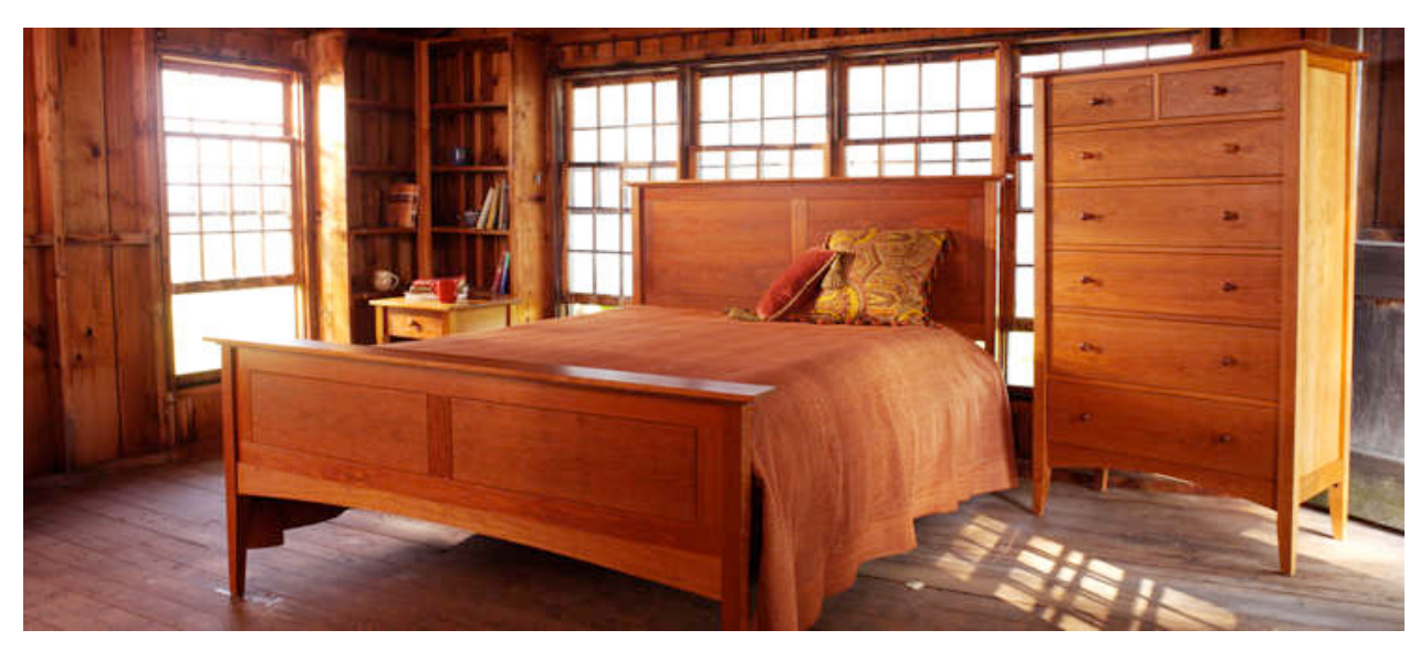
Regional Branding Example: Made in Vermont. Regional branding can directly influence on the product price: the available researches show that furniture branded as Made in Vermont can achieve up to six percent higher price on the market when compared to other Northern Forest brands. Regional branding, therefore, presents a way of promotional strategy, which includes all activities that make some area attractive for living, working, and entertainment, by encouraging the development of the regional economy and contributing to the regional development. All available studies show that there is no standard manual on the development of the regional branding; Each region is marked by its specific physical, social, cultural and historical characteristics, which define the specific context for the branding of a region. The only thing in common to each of those regions is a strong passion on the mobilization of inhabitants to involved in the development of their reaion.

economic impact that those sectors have are often not recognized on the national, but only on the regional level, and it is expected that the importance of FBI sectors will rise