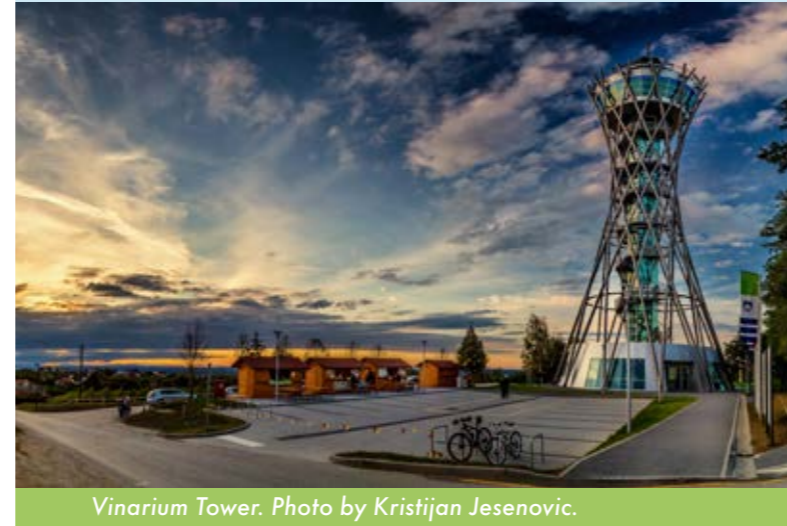
Vinarium Tower.

1. Stimulate environmentally friendly behaviour in tourism sector – development and testing of the Responsible Green Destination Tourism Impact Model (RGD TIM model), which will form the basis for establishing the transboundary destination Amazon of Europe. It will combine latest