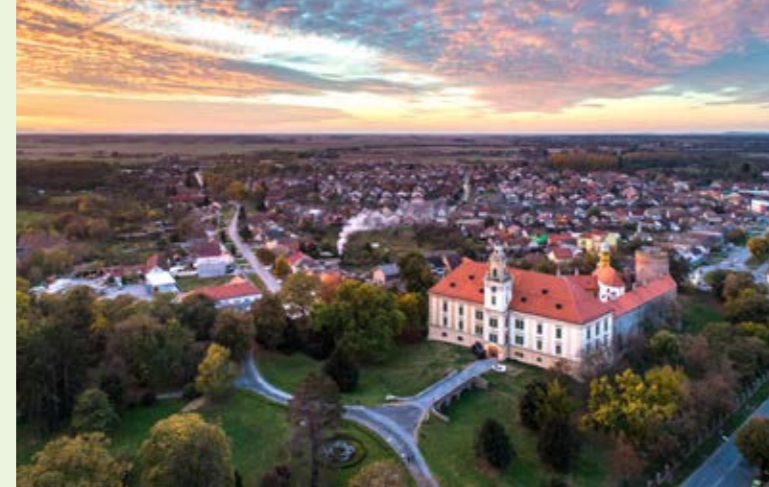
Castle Prandau Normann.

AoE destination will be a joint and integrated solution for sustainable tourism, including: