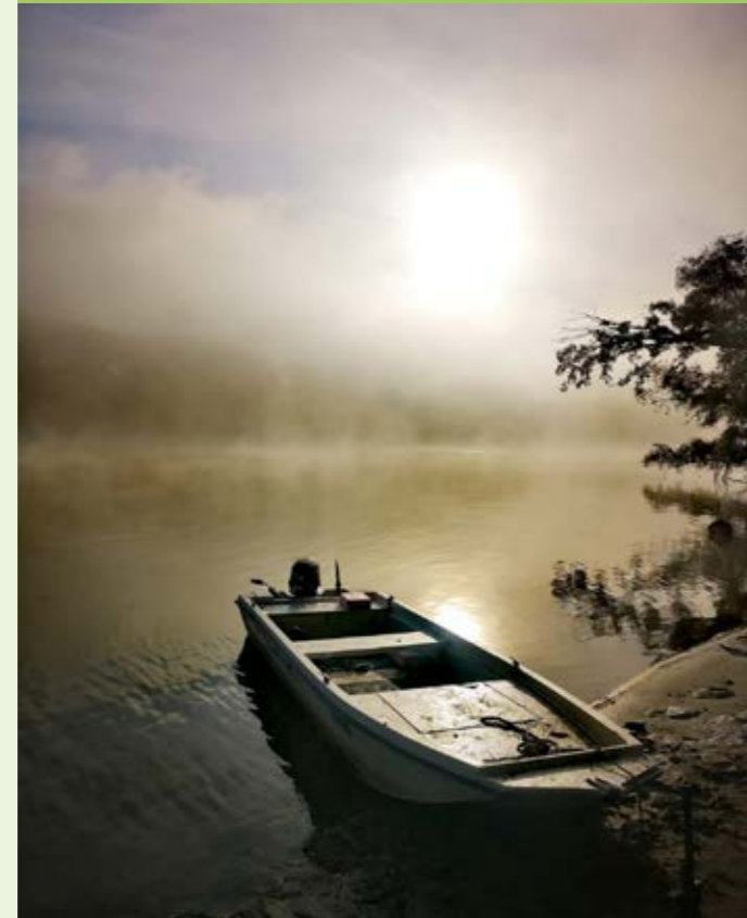
Green island.