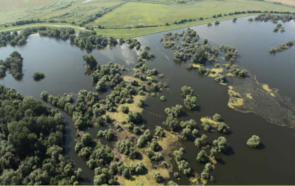
NP Kopački rit.

The river landscape Mura Drava Danube (TBR MDD) is connecting 12 protected areas and uniting 5 countries along 3 rivers into first world pentilateral biosphere reserve. The future UNESCO biosphere reserve known as Amazon of Europe (AoE) represents the largest and most preserved free-flowing river system in Central Europe. Valuable natural beauty, endangered habitats and diverse cultural traditions have enormous potential for sustainable tourism, while underdeveloped border regions face lack of capacities, unemployment and emigration.