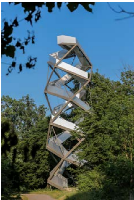
Bad Radkersburg Mur tower.

Did you know that the TBR MDD area provides a great opportunity for the development of sustainable tourism?