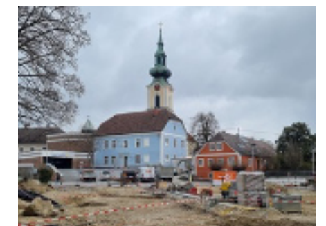
Leonding, House No 44 / Austria

"One of the Covid-19 Phoenix effect for Leonding is the InLeonding-App. This makes the Leonding economy digitally visible. The purchasing power in the region is increasing and jobs in the region can be accessed digitally. Special Covid-19 Phoenix effects are also evident in the redesign of the town square. This is where the mobility hub comes in. This connects with the surrounding communities."