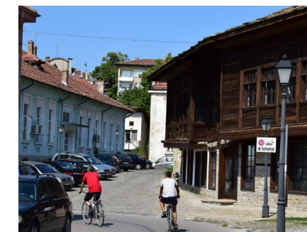
City of Gabrovo, District 6 / Bulgaria

"The city centres (excluding state, municipal or other types of administrations) will start lagging behind unless they host arts, tourist sights and, connected to them, cafes, restaurants, souvenir shops, etc."