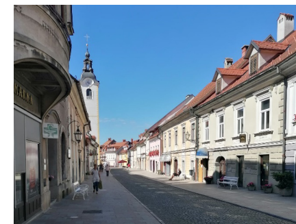
Kamnik City Centre / Slovenia

"The future of city cores will be based on experiences, hybrid events and small craftsmen and entrepreneurs, which will add value to the cities. It is important to revitalize urban centres, and this goal will only be achieved by bringing back smaller businesses that will have their premises in the centres."