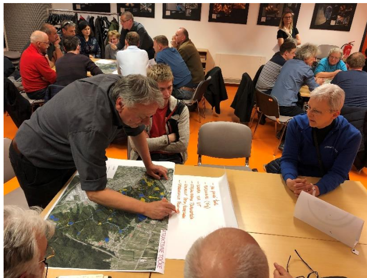
Groupwork with Golovec hill private forest owners in Ljubljana on 11 th March 2019.

Based on above described concept and design CoL, SFS and external experts implemented the 2 nd workshop with forest owners on Golovec hill in Ljubljana on 11 th March 2019. 30 participants responded to the invitation. They represented a diverse forest owner group as representatives of small, medium and large private forest owners were present. This is important, as view-points from private forest owners of different sizes proved to be diverse.