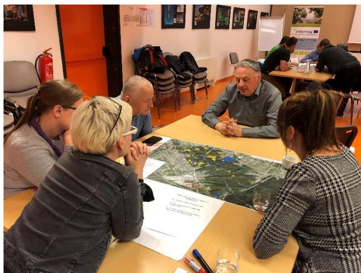
Groupwork with Golovec hill forest users in Ljubljana on 12 th March 2019.

CoL, SFS and external experts also implemented the 2 nd workshop with forest users on Golovec hill in Ljubljana on 12 th March 2019. 18 participants responded to the invitation. This is lower number than expected, however we have to emphasize that several bilateral meetings were held prior to the workshop, where focus groups representatives were named to represent a specific group of stakeholders. This also contributed to more even representation of key stakeholder groups.