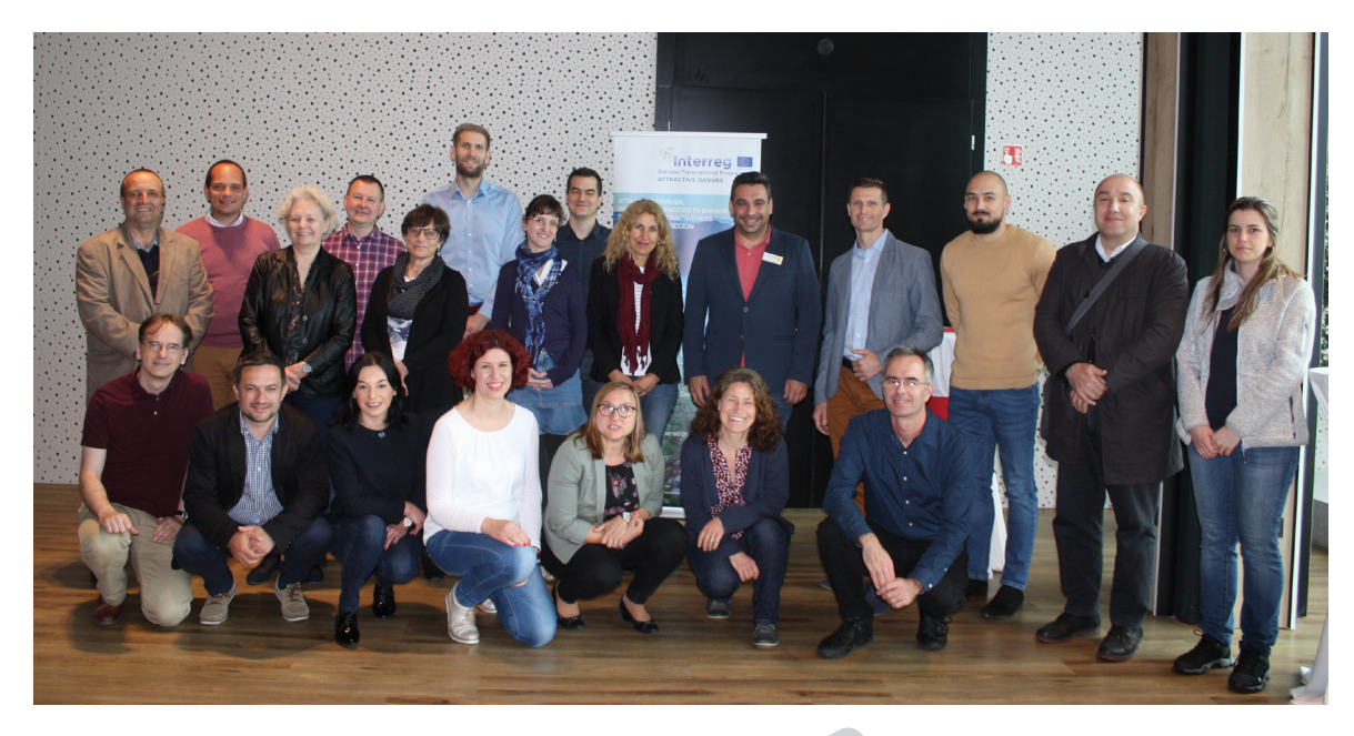
Final project meeting 30th May, 2019