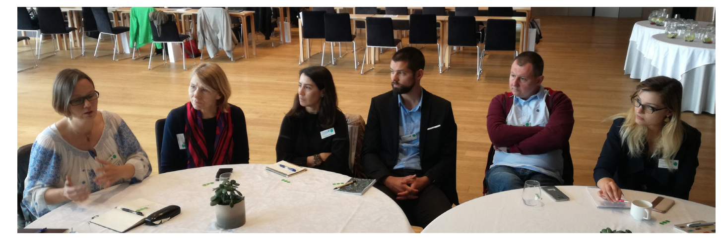
Pannel discussion Can sustainability be an attractive development objective for regions in the future?