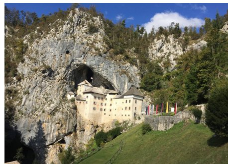
Predjama Castle – largest cave castle in the world, Postojna, Slovenia