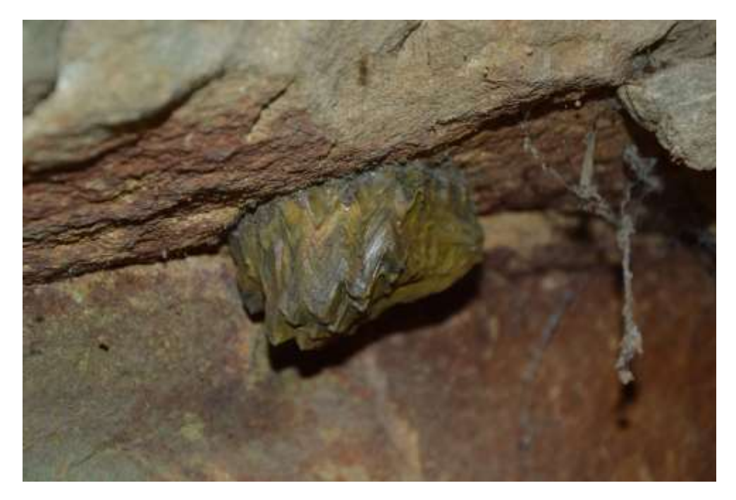
Fossil oyster cast in terrain