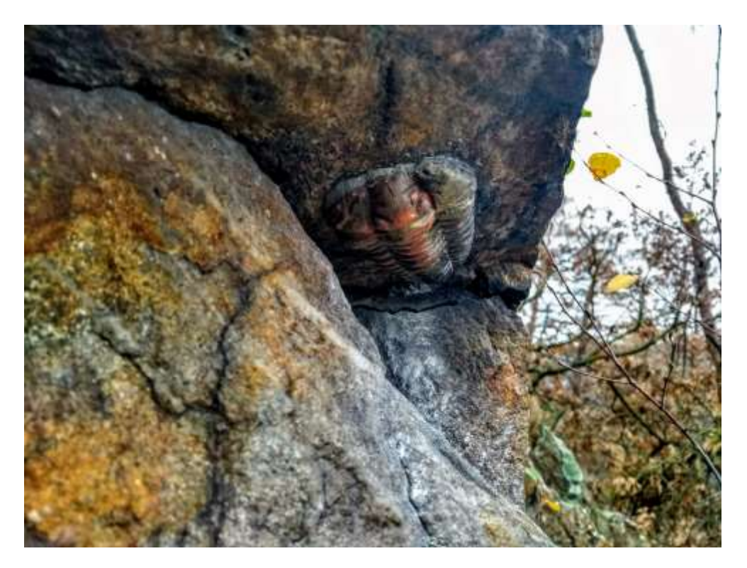
Trilobite cast in terrain