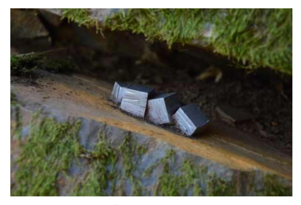
Pyrite cast in terrain