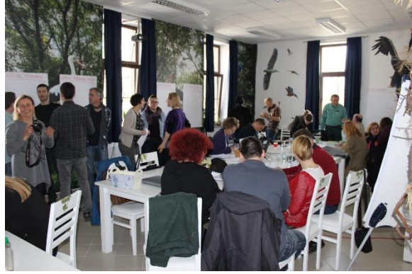
Figure 3-1: Project Partners and workshop participants from coop MDD at the first workshop in Noskovci (Croatia), February 28<sup>th</sup> -March 2<sup>nd</sup> 2017.