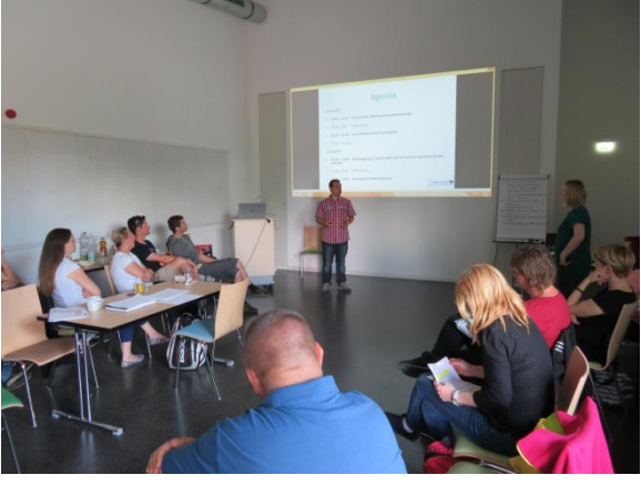
Figure 3-2: Project Partners and workshop participants from coop MDD at the second workshop in Havelberg (Germany), May 30<sup>th</sup> -May 31<sup>st</sup> 2017.