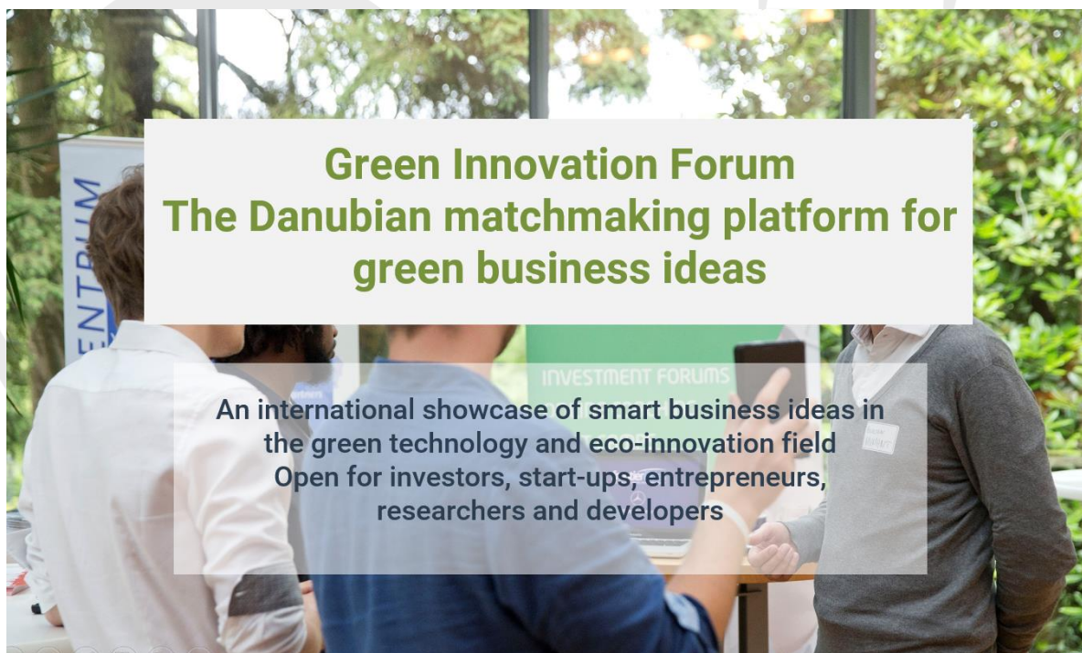
Figure 1 Format of the Ecolnn Green Innovation Forum