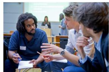
Training and Coaching