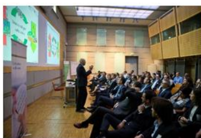
Matchmaking and Pitching