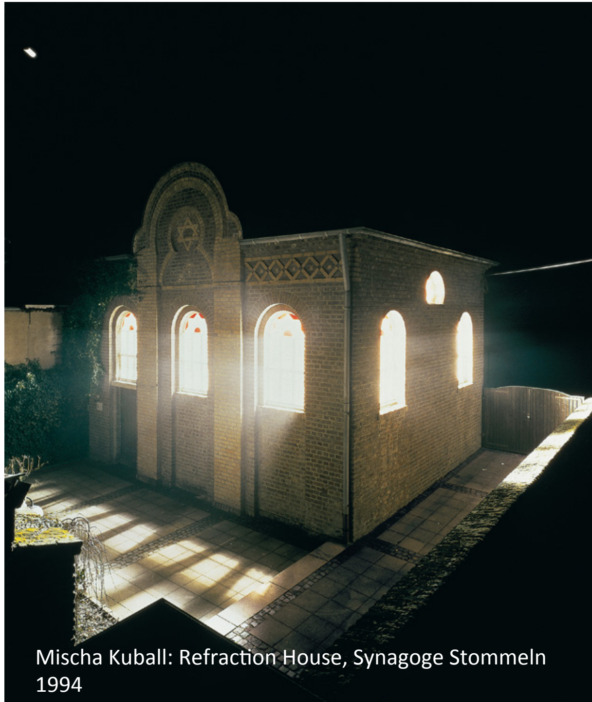
Mischa Kuball: Refraction House, Synagoge Stommeln 1994