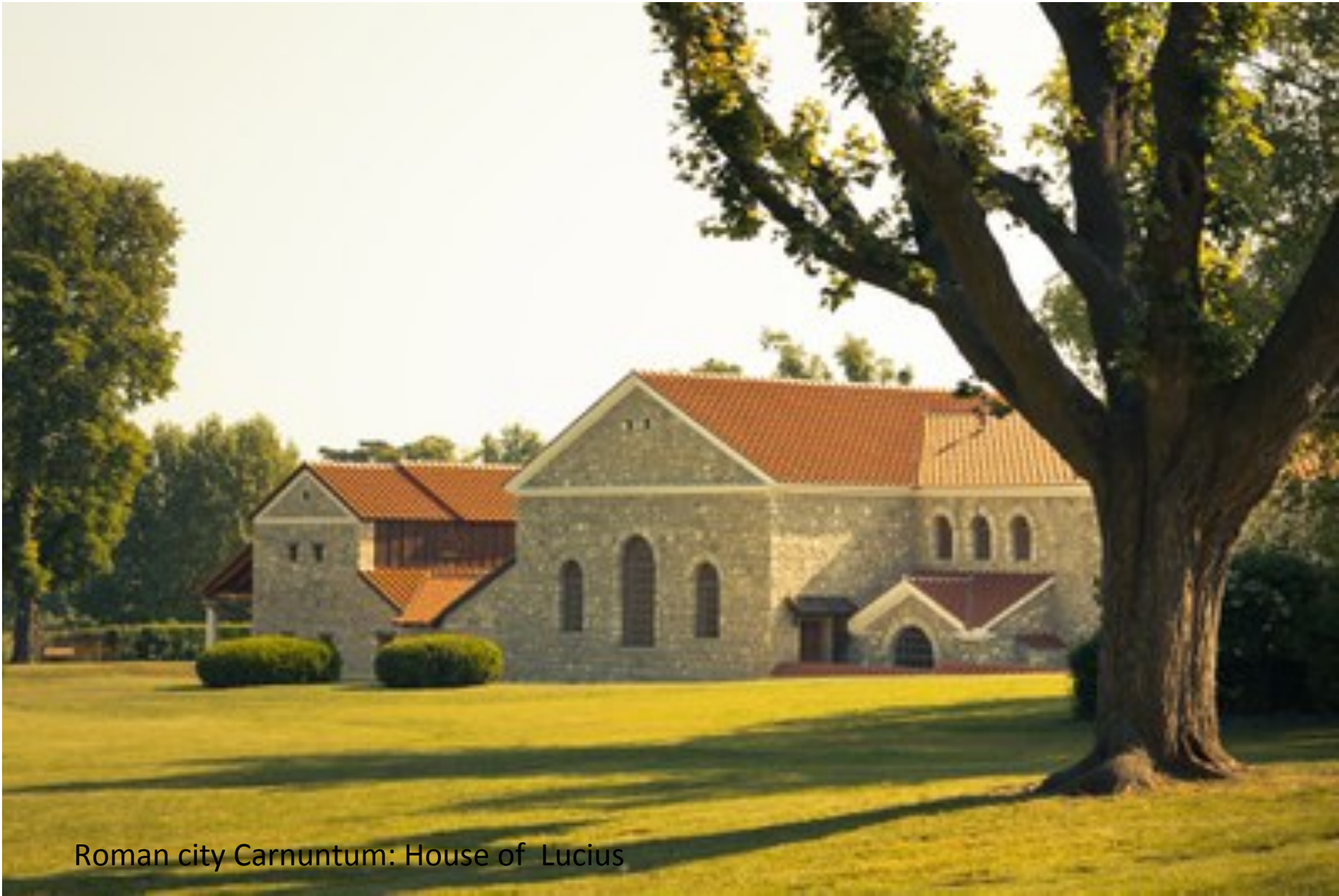
Roman city Carnuntum: House of Lucius