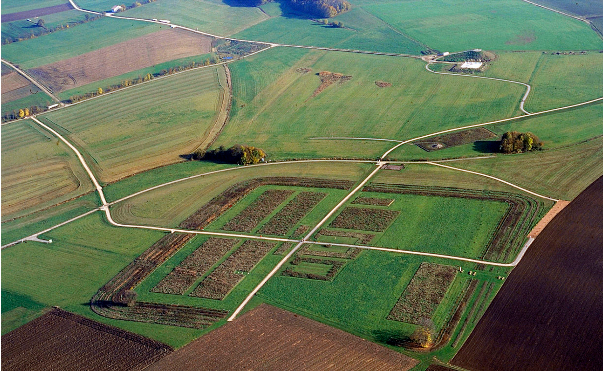
Camp of a Roman legion in Ruffenhofen: aerial view, the outlines of Roman structures have been marked with vegetation