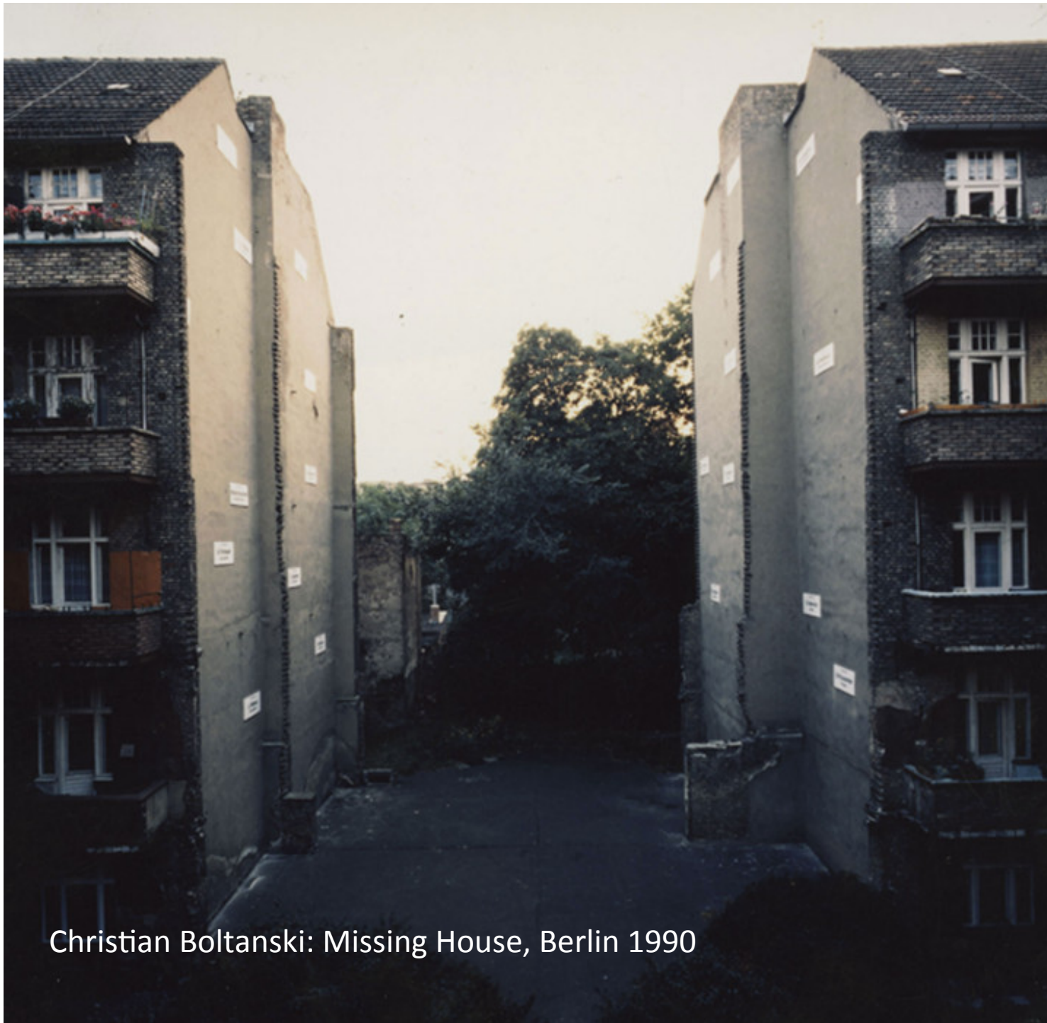
Christian Boltanski: Missing House, Berlin 1990