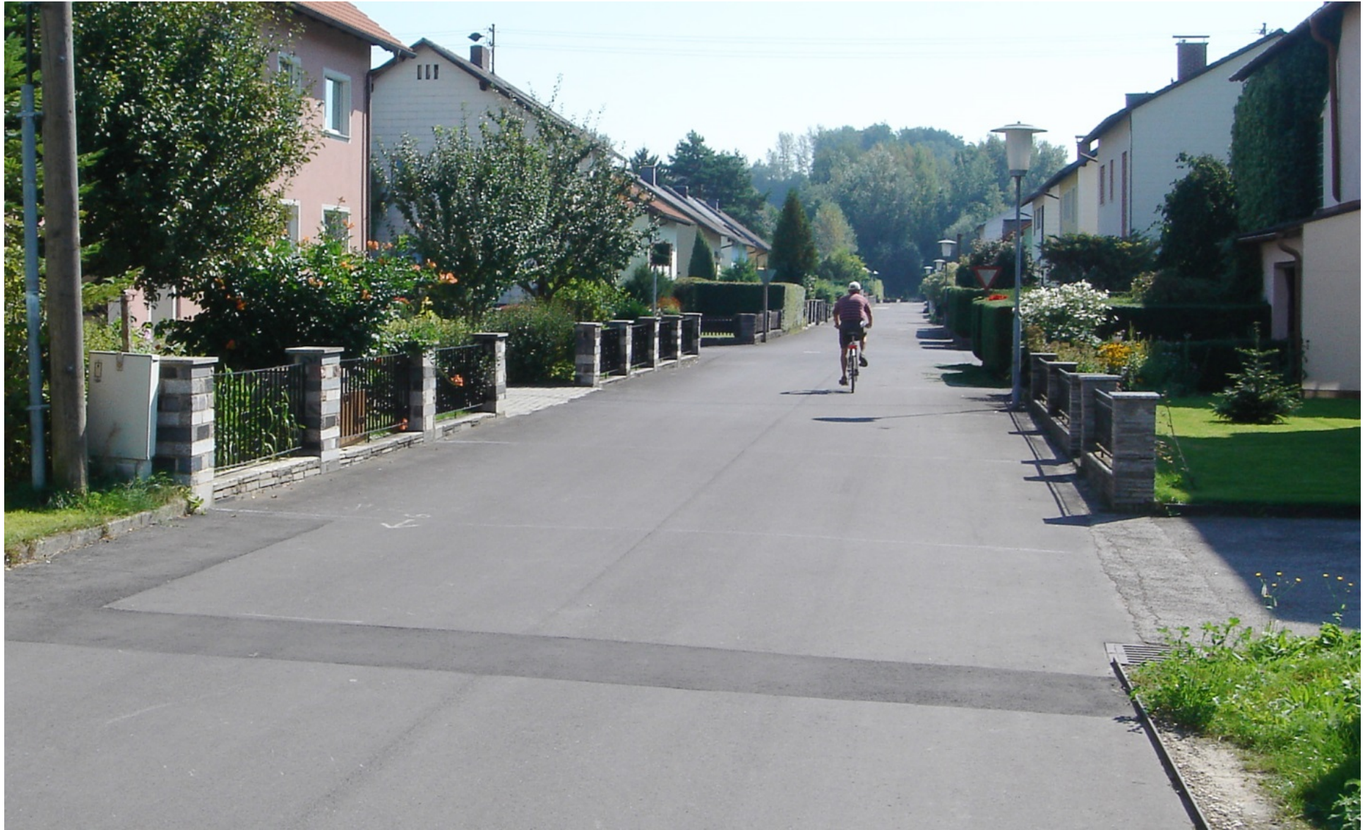
Sheds of the camp Gusen I used to line today's Gartenstrasse between 1940 and 1945