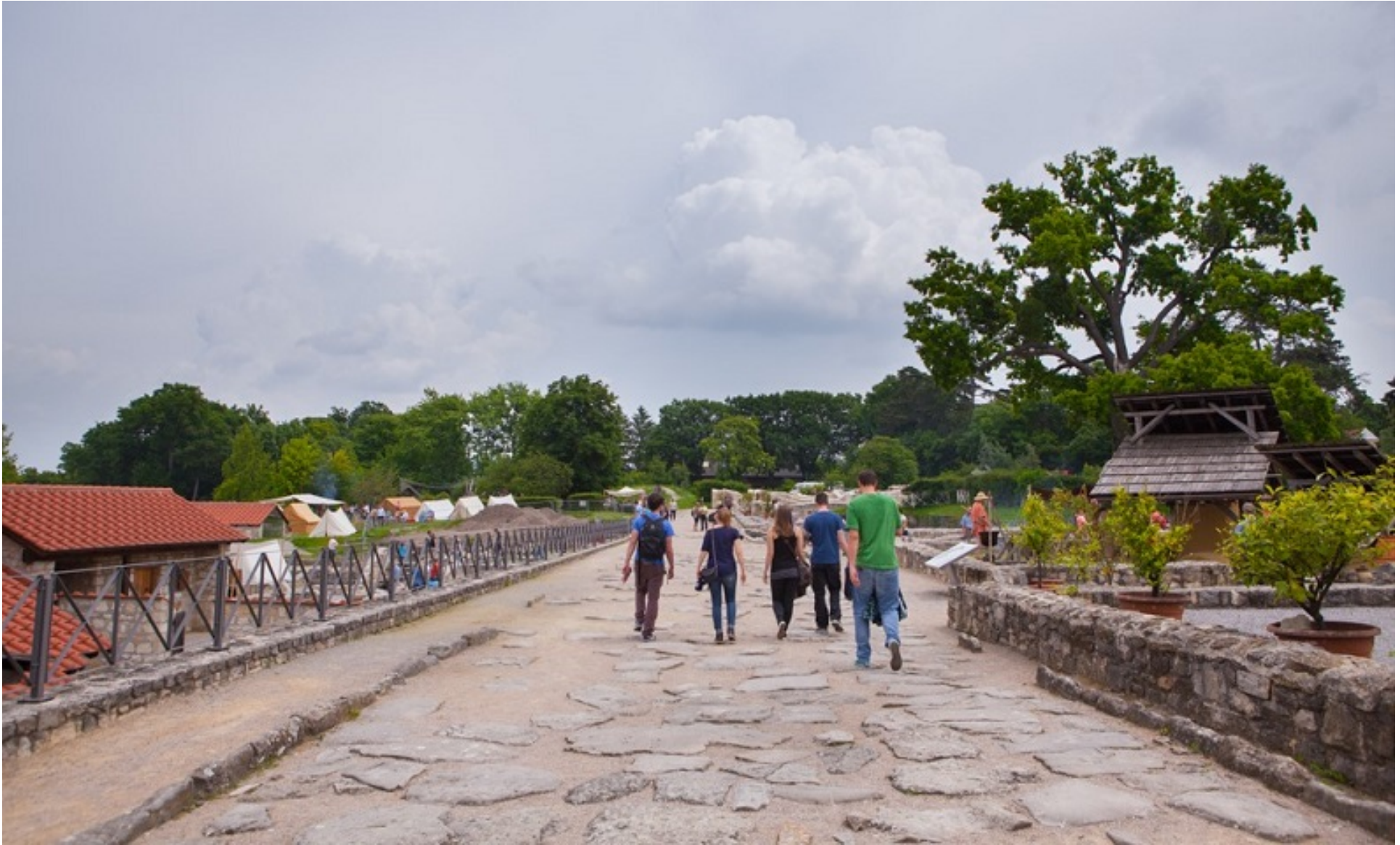
Roman city Carnuntum: Roman city quarter