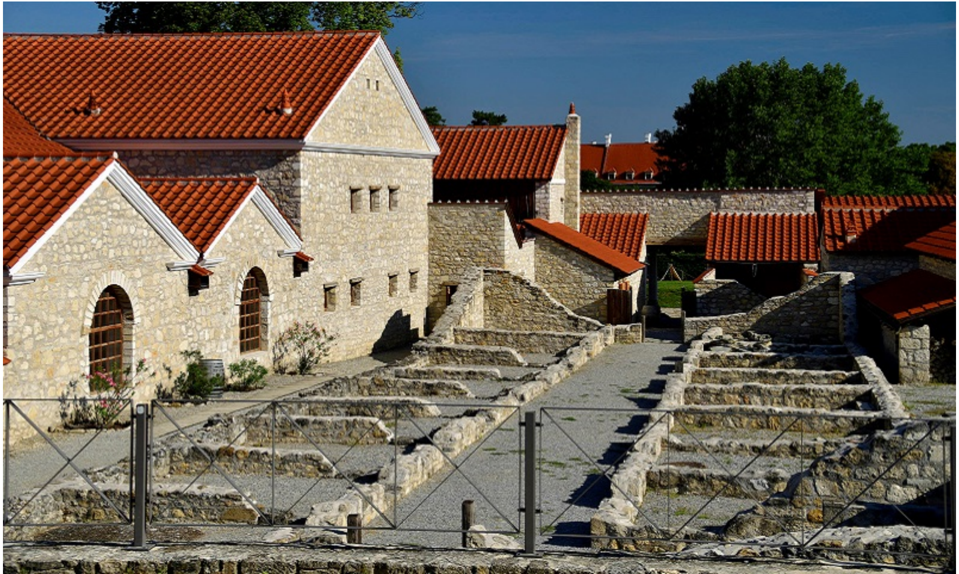
Roman city Carnuntum: Roman thermic spring