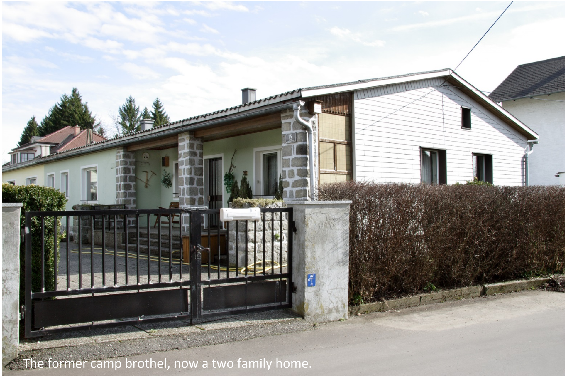
The former camp brothel, now a two family home.