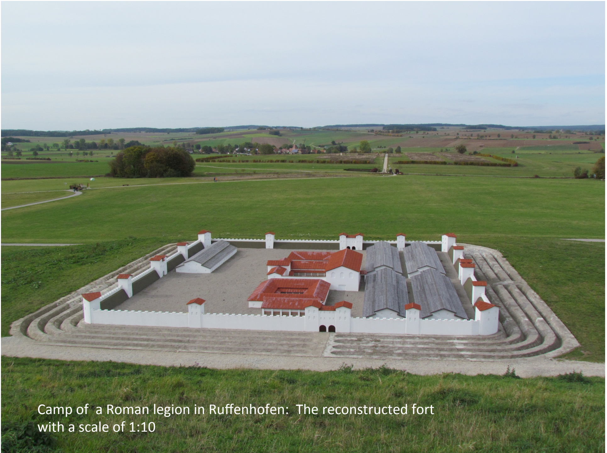
Camp of a Roman legion in Ruffenhofen: The reconstructed fort with a scale of 1:10