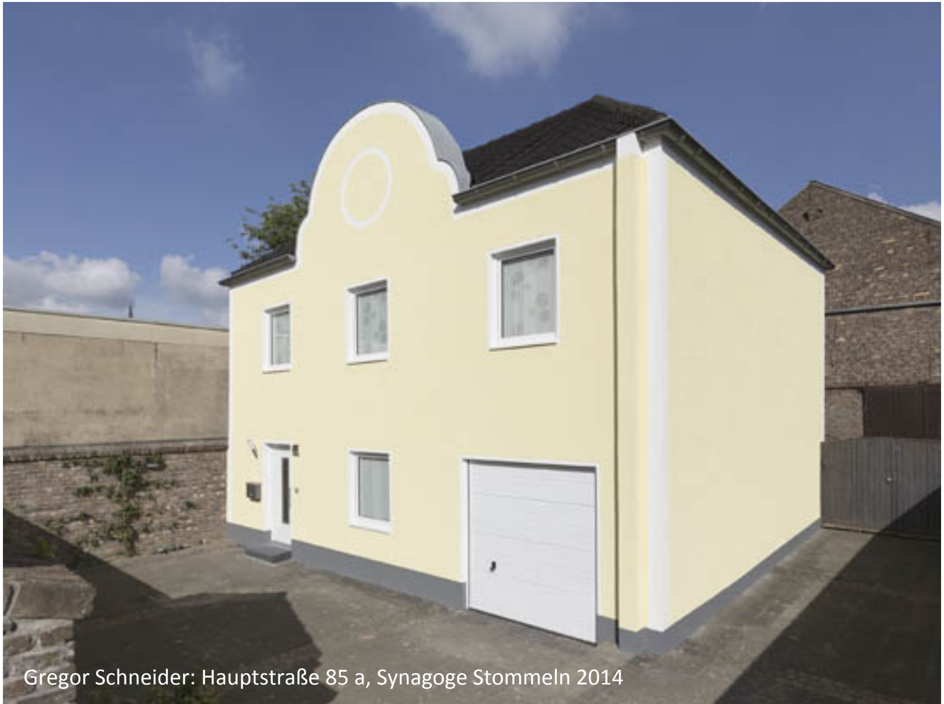
Gregor Schneider: Hauptstraße 85 a, Synagoge Stommeln 2014