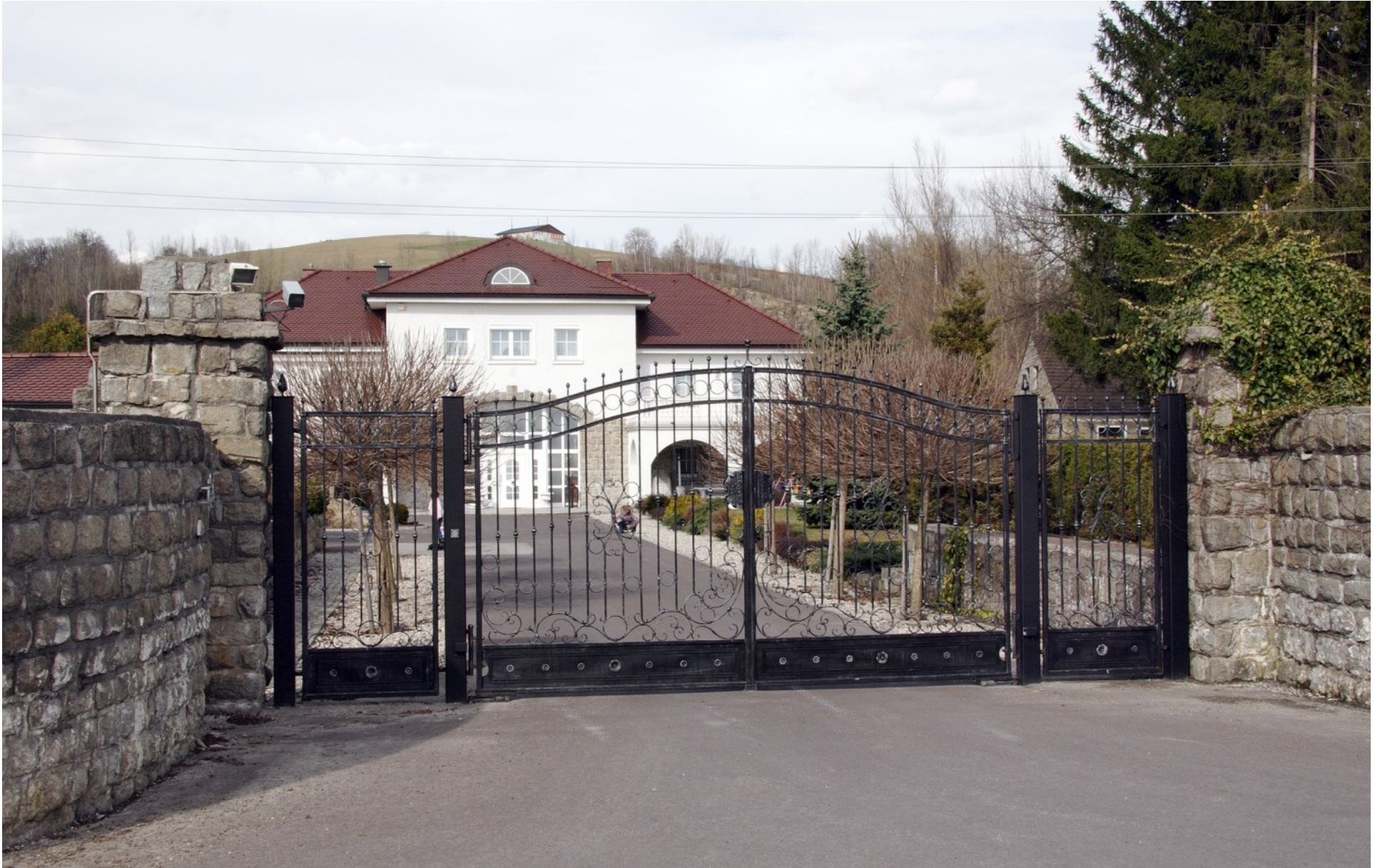
The former entrance to the camp with the entrance building (“Jourhaus”), now a private estate.