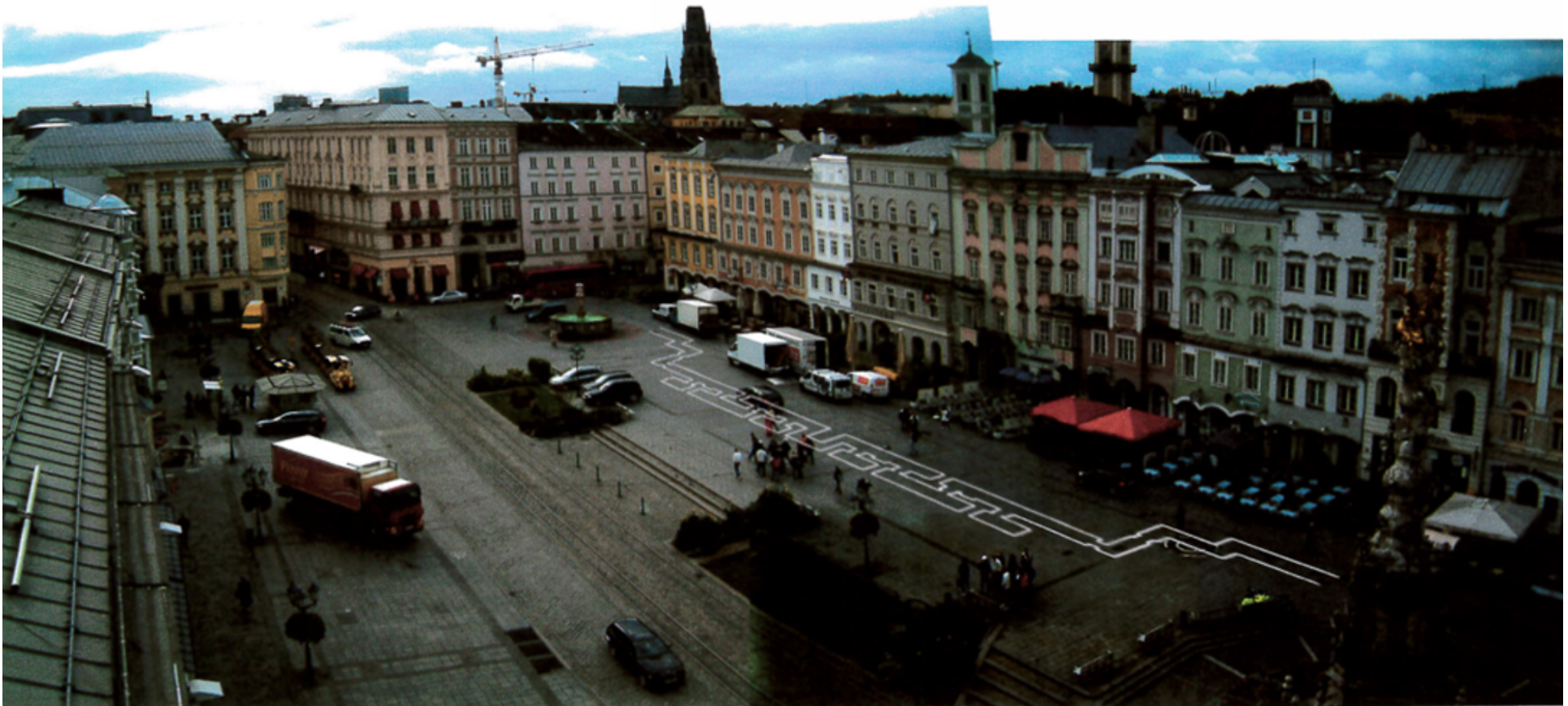
Mischa Kuball: Hitler bunker Linz, project development for Linz 2009 European Capital of Culture