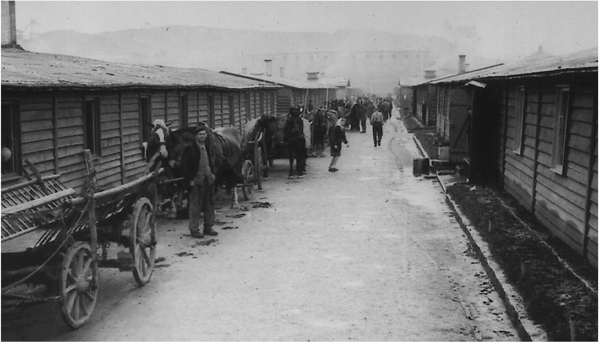
Today's Gartenstrasse in Gusen, shortly after the liberation of the concentrations camps Gusen I and II, in May 1945.