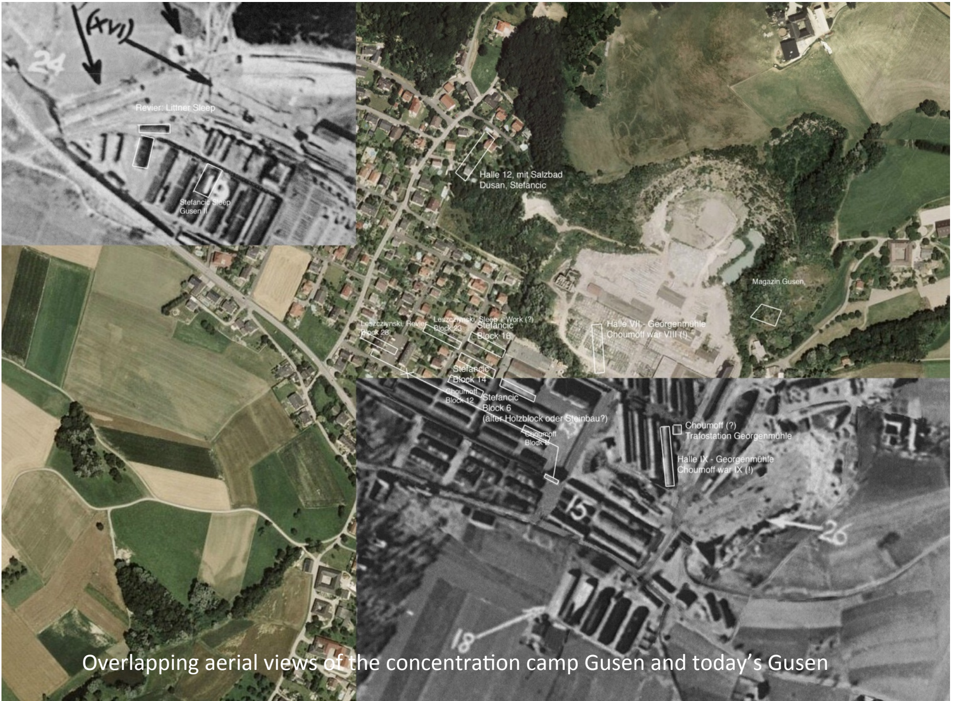
Overlapping aerial views of the concentration camp Gusen and today's Gusen