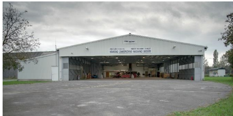
Croatian Aviation Training Center, Airport Lučko