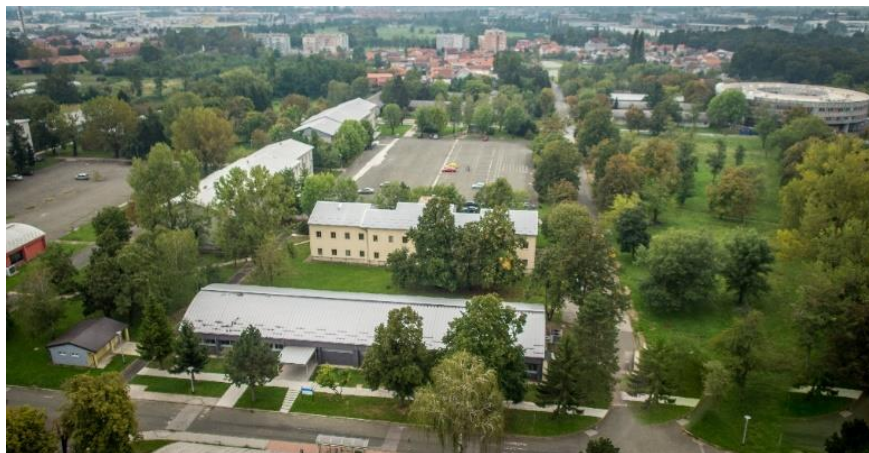
University Campus Borongaj, Borongajska 83, 4 buildings