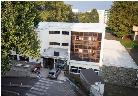
Main building, Vukelićeva 4