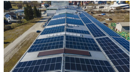
Solar power plant with a capacity of 437 kW at the ESOF business facility installed in 2021

findings on the current energy situation, the Smart Grid Strategy and Action Plans were developed with the associated partners and stakeholders.