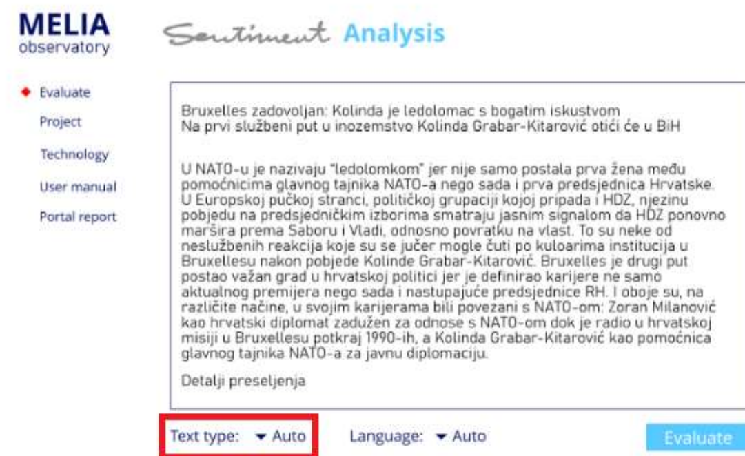
Figure 4. Text type option is enabled after entering text or link(s) in the main text box

The same goes with text type – you may select “news portal text” or “social media post”, or let the system automatically detect the type of text it is dealing with.