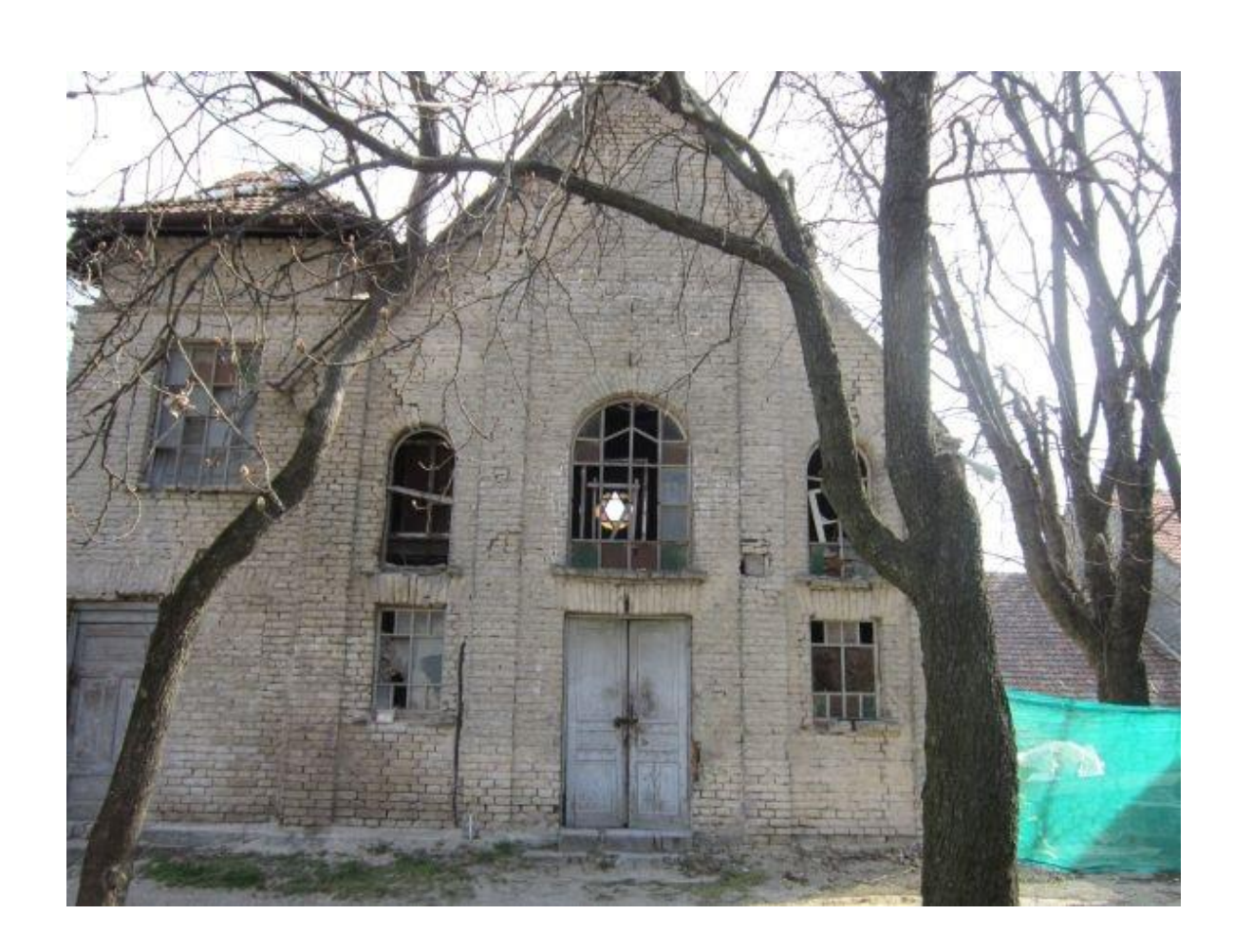
Sinagogue from Ingus castle in Hajdukovo (near Subotica) – current state