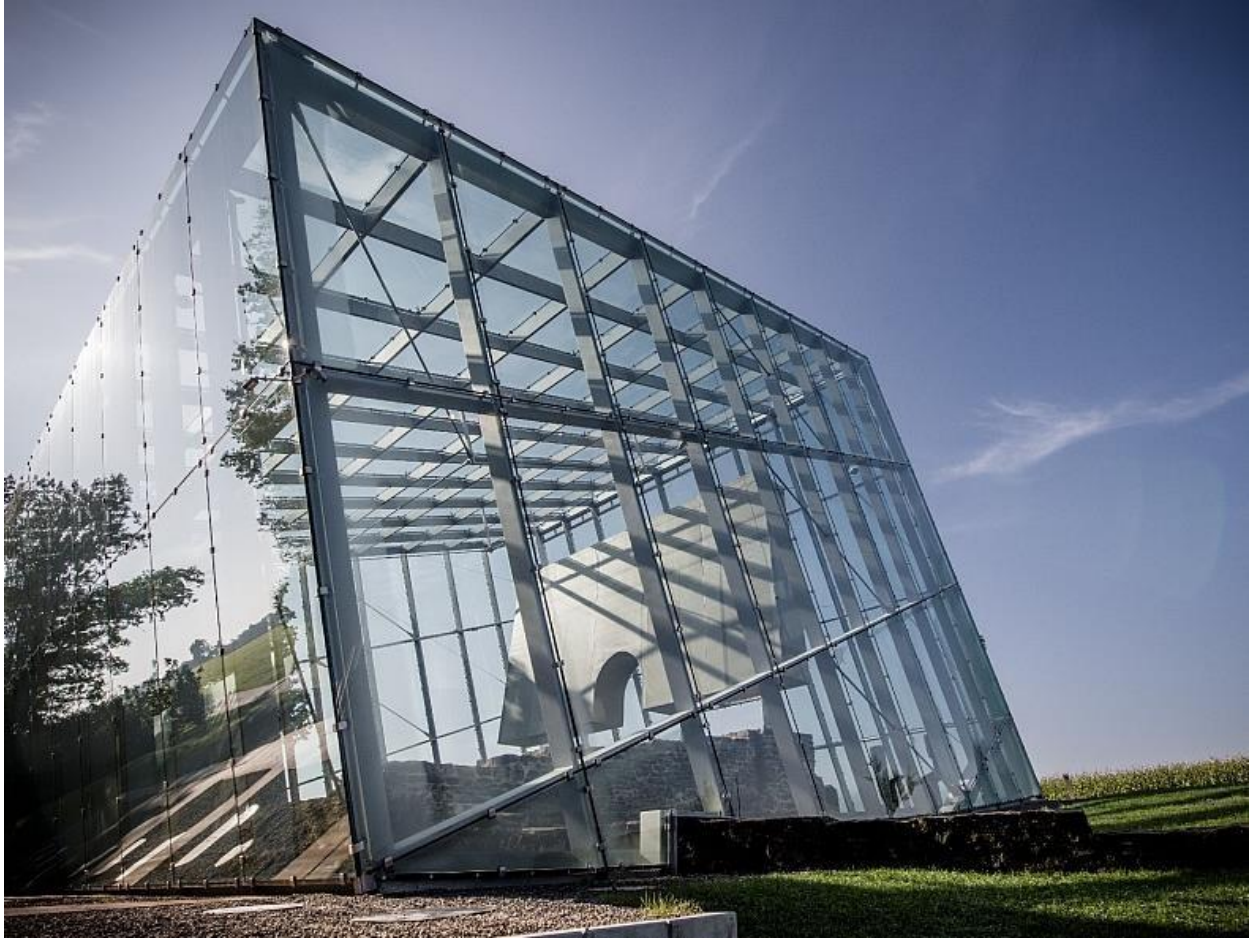
Picture 2 Remnants of the LIMES Dalkinger Gate before construction of the protective shelter