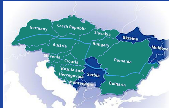
INDEED Project countries (green area)

INDEED aims to improve the knowledge and skills of all professions involved in dementia care, promote their collaboration and stimulate entrepreneurial engagement for people with dementia. To reach these objectives, a coherent educational and skill-building intervention is developed and tested. The intervention package will be made available to all interested parties in the Danube region.