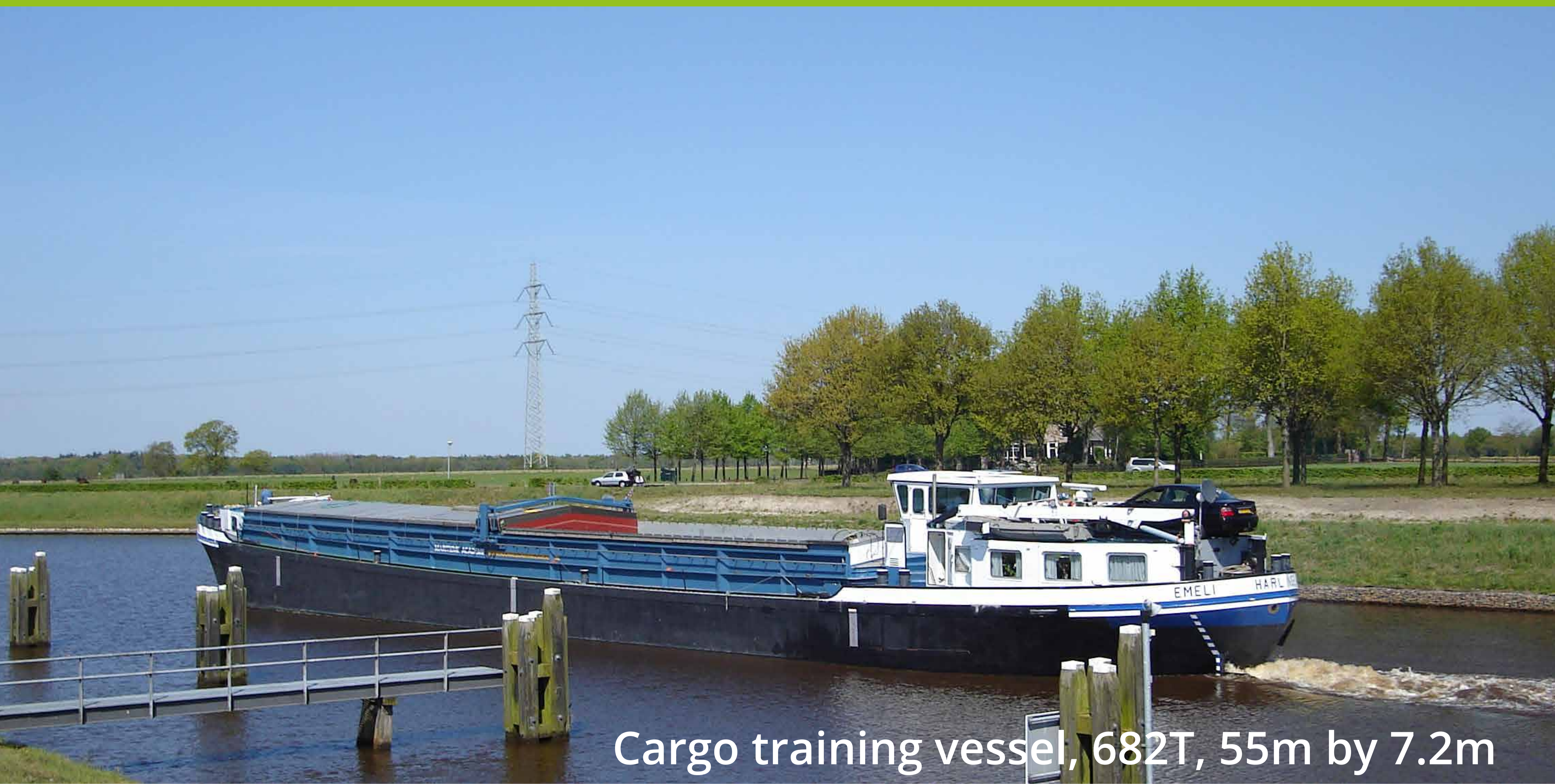
Cargo training vessel, 682T, 55m by 7.2m