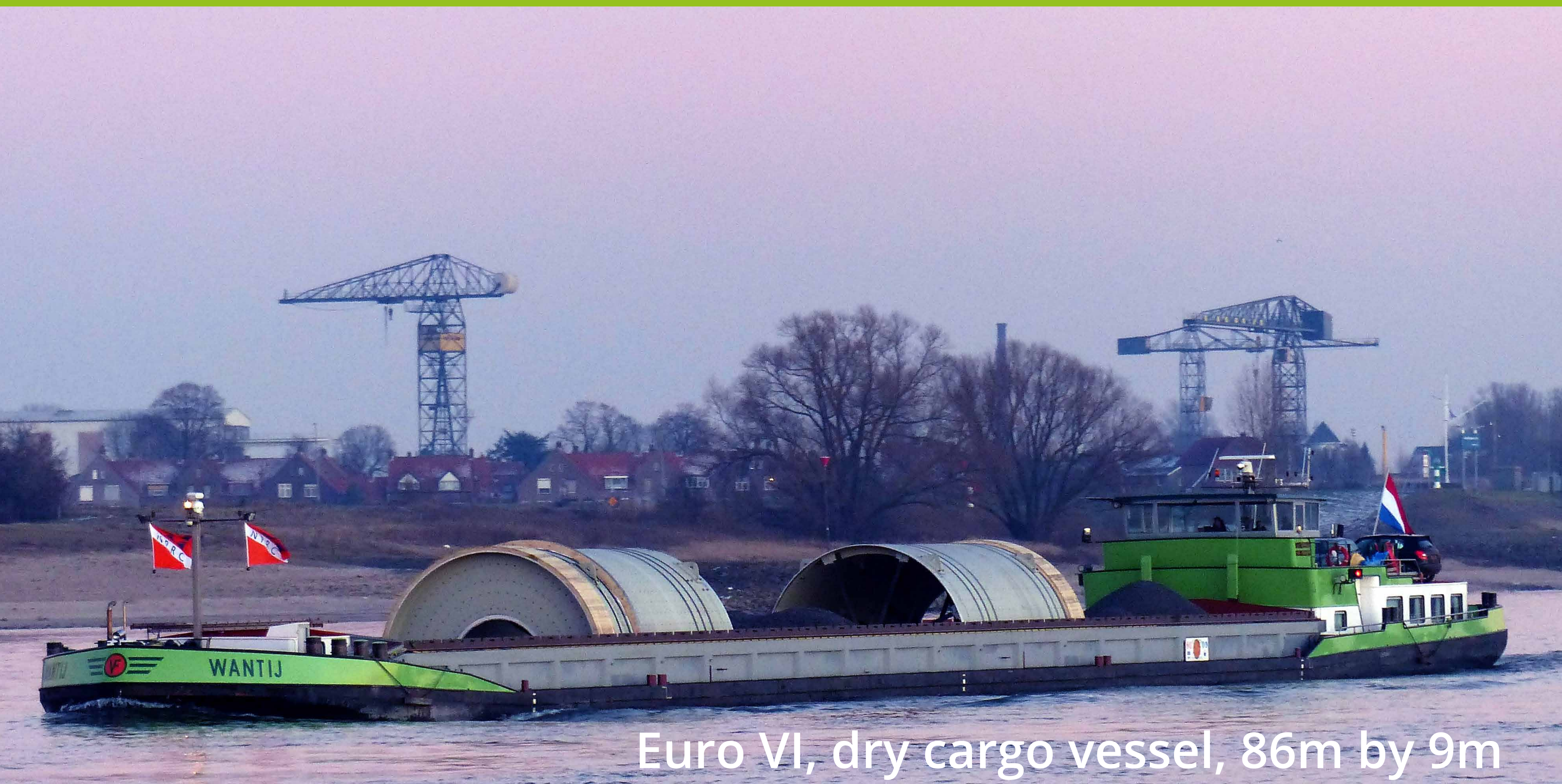
Euro VI, dry cargo vessel, 86m by 9m