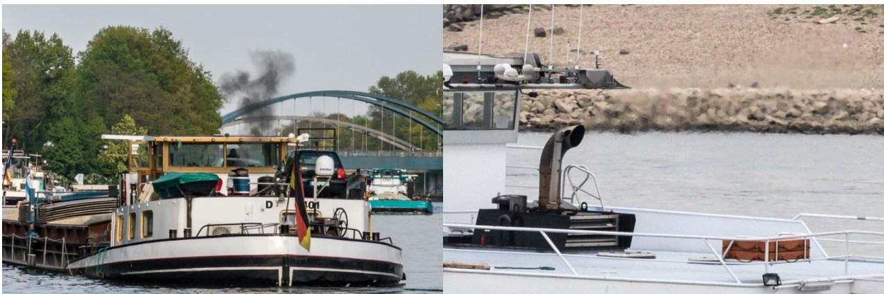
Figure 2: Pictures of exhaust plumes (left: engine reversing, right: typical appearance at steady state operation)