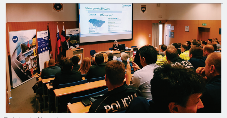
Training in Slovenia