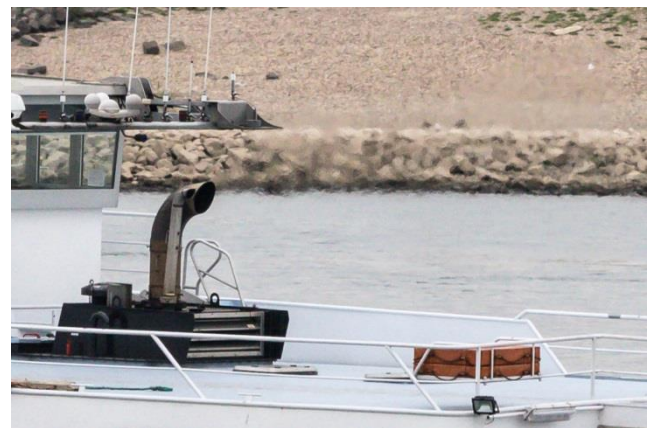
Figure 2: Pictures of exhaust plumes (left: engine reversing, right: typical appearance at steady state operation)