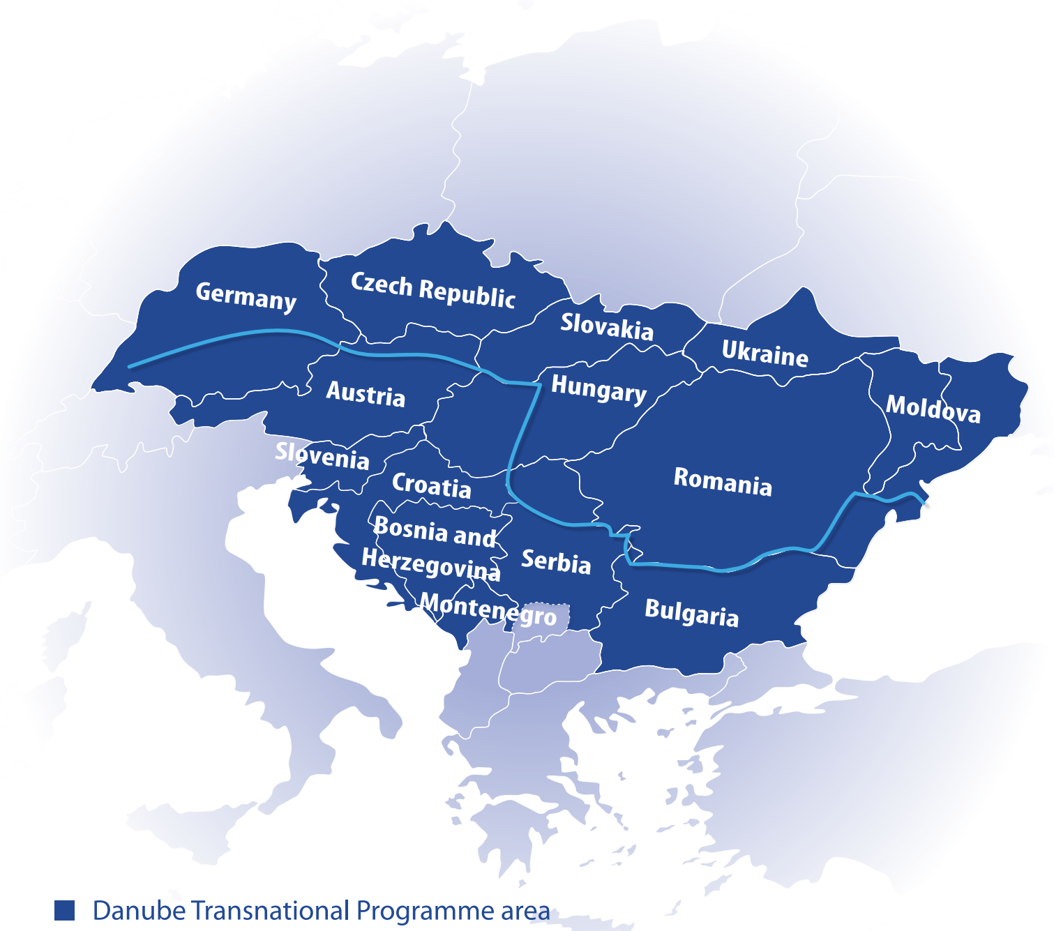
■ Danube Transnational Programme area