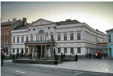
Seminar in State Scientific Library Košice