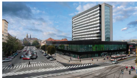
Meeting point for 2 nd day In the front of the DoubleTree by Hilton Hotel Kosice